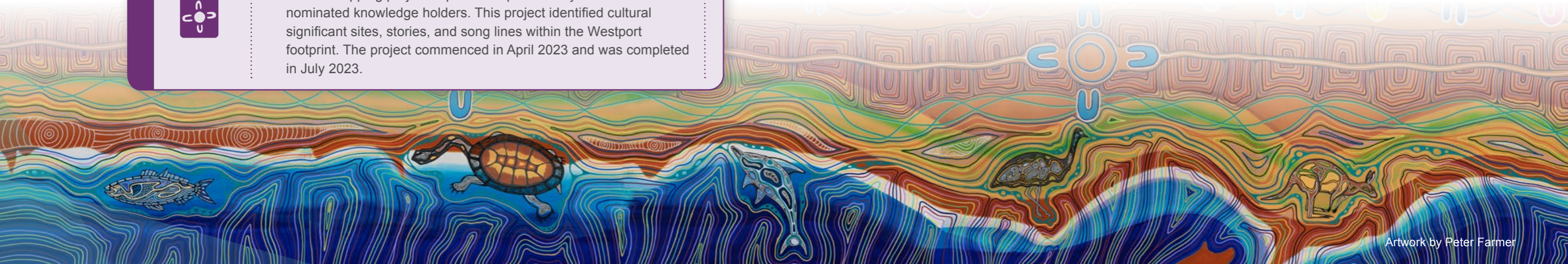
Artwork by Peter Farmer

Westport partnered with Optimal Services for the delivery of Cultural Awareness Training. The training module was informed by the Westport Noongar Advisory Group who input training components that they wanted included for Westport's knowledge awareness and growth.