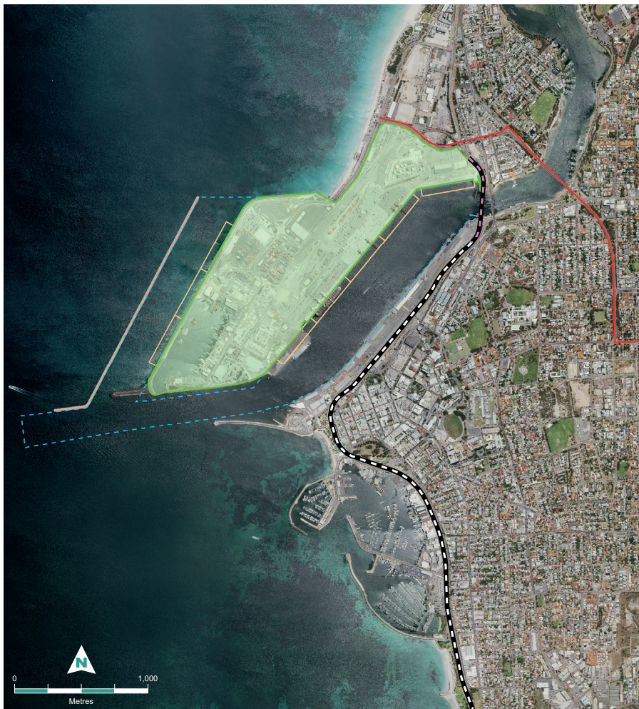
Diagram 2: Expanded Inner Harbour footprint to handle 3.8 million TEU

Assuming the supply chain constraints could be addressed, expanding the Inner Harbour's berth-face capacity from 2.1 million TEU to handle between 3.8 million and 5.4 million TEU would also pose significant challenges. As with all options, it would need to accommodate many more ships and require water depths of up to 18 metres to handle the big ships of the future, as well as the ability to increase its throughput if container growth exceeds the forecasts.