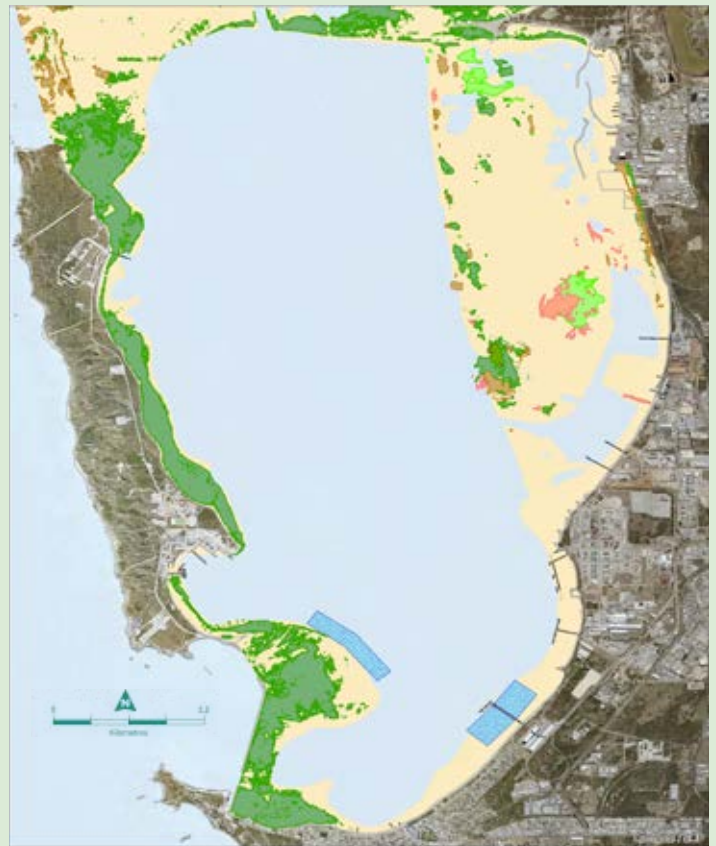
Map 1: Environmental values present around Cockburn Sound

Westport then commissioned the independent Western Australian Marine Science Institution (WAMSI) to conduct a literature review to refine the list of ecological and social values and to undertake a preliminary risk assessment to inform Westport's process.