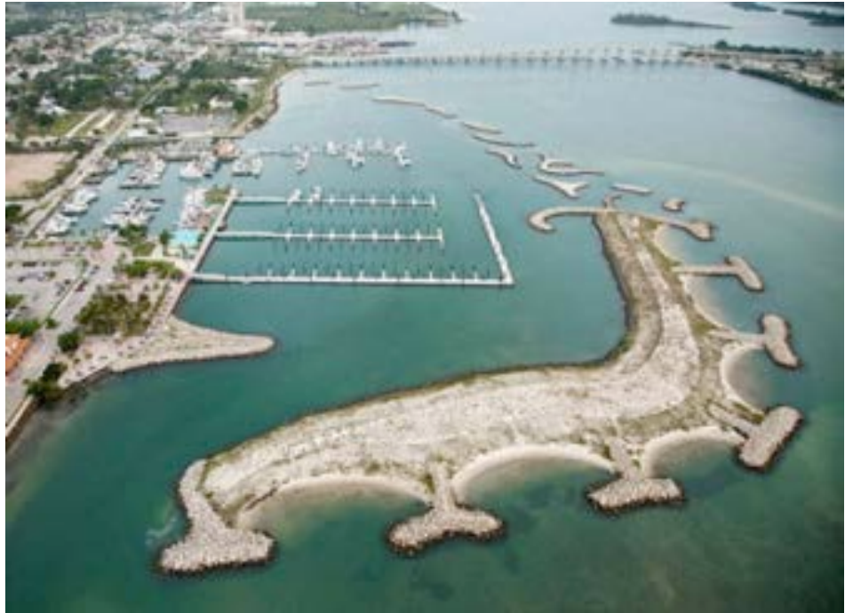
City of Fort Pierce island breakwater system, Florida, USA

Westport is investigating the potential to incorporate global best practice into our planning. Port design is one of the areas where international projects have successfully been able to achieve environmental and social benefits. Westport is looking at innovative approaches to see whether they can be implemented in Cockburn Sound. One such example is the 15-acre island breakwater system (above) developed by Tetra Tech for the City of Fort Pierce marina in Florida.